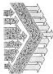
FIGURE 2 AIR BEAR® FILTERS